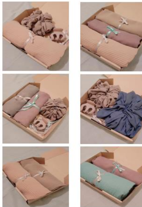
Fig. 2. Sample of Products

Hijab hampers are arts and crafts designed to gift others by giving them an interesting and unique impression. The contents of these hampers can be requested as desired, each different content of course has a different price.