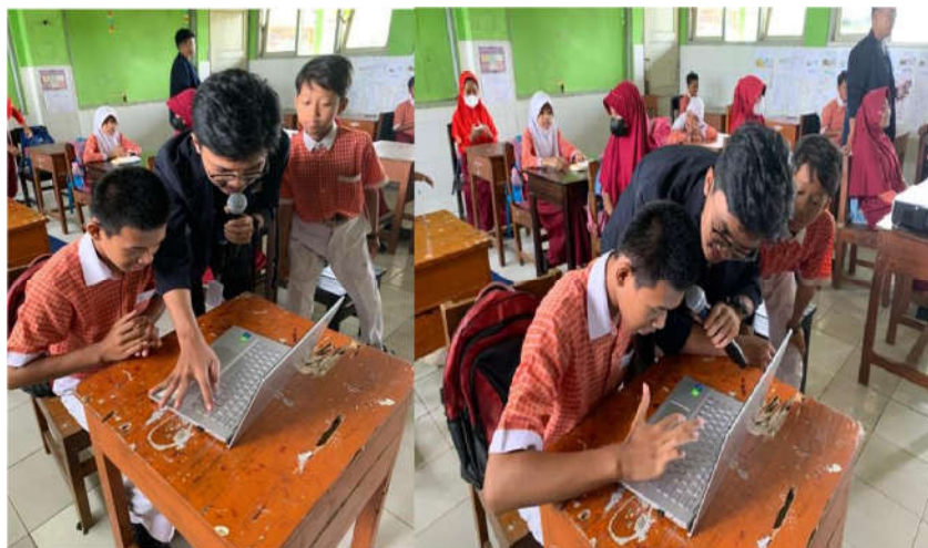
Fig. 3. Students practice directly with the help of resource persons

the direct practice method used, students understand more because they directly practice the material provided, of course, guided by the resource person.