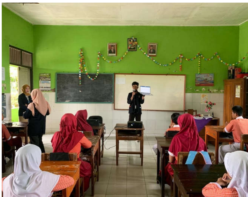
Fig. 2. Students listen to the presentation of the material by the resource person

Students and lecturers completed the software and Microsoft Word introduction training program at Harapan Bangsa University. This training was held on Thursday, 9 February 2023, in the classroom of one of the elementary schools in Sokaraja, precisely at SD Negeri 2 Karangduren, especially in grade 6. The training was held for 60 minutes, starting at 09.30 WIB and ending at 11.30 WIB.