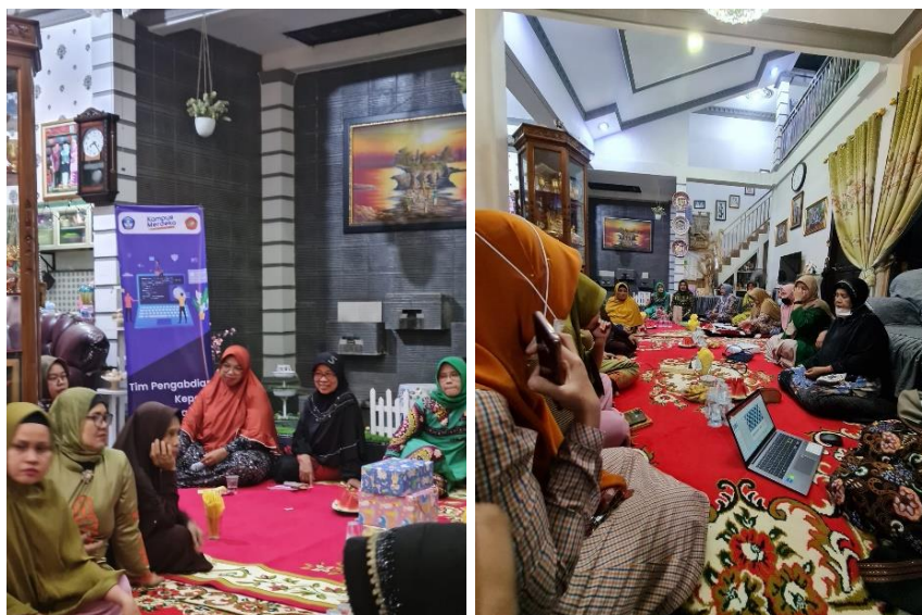
Fig. 2. Training Activities