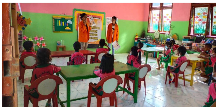
Fig. 1. Recognizing body parts through image media.

The introduction of body parts through the media of images is very important so that early childhood knows which parts can be touched or touched by themselves and which parts cannot be touched by others, so that children can protect themselves from other people's behavior. those around them who might commit sexual harassment or immoral acts against them are shown in Figure 1. Touch is permissible, namely the touch made by other people on the head, hands and feet. While touching is not allowed, namely touching the body, chest, stomach and around the pants.