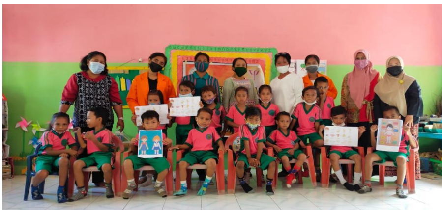
Fig. 4. Group photo of early childhood teachers after the psychoeducation activity

At the end of this sexual psychoeducation activity, we took a photo with the early childhood children at the Mawar PAUD Post, the teachers at the Mawar PAUD Post and the Psychology Study Program Community Service team at Nusa Nipa University, shown in Figure 4.