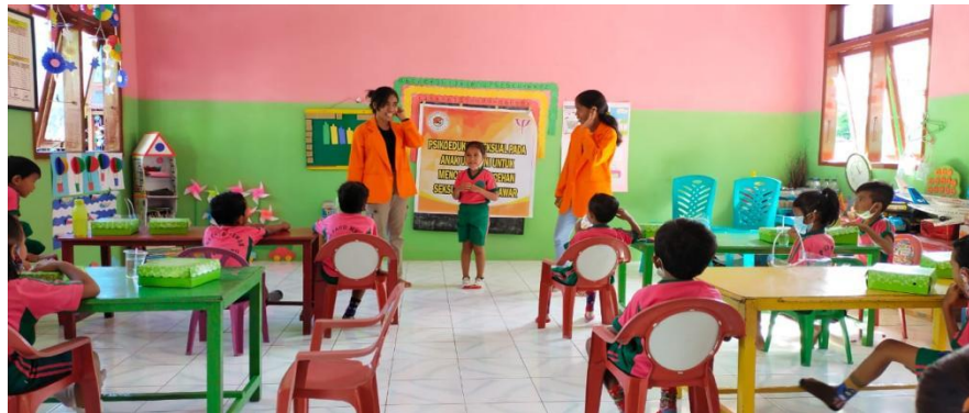
Fig. 2. Practice recognizing and holding body parts

The practice of knowing and holding body parts is very important to be taught from an early age to young children so they know which parts of the body can be touched by themselves and which parts cannot be touched by others, shown in Figure 2. This is to protect them from irresponsible behavior of the people around him be it relatives, friends, family or other people. They can refuse or say no, if someone wants to touch or feel parts of their privacy or report to parents or teachers at school if there is unpleasant (immoral) behavior that they have experienced.