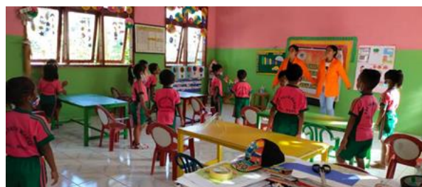
Fig. 3. Singing the song “touch is allowed & not allowed”

Conveying information will be more optimally received by young children through activities that are fun for them, one of which is through the method of singing or songs as shown in Figure 3. Through songs, the messages to be conveyed will be more easily accepted and remembered by young children. Through this song, young children are taught to know which parts of the body can be touched by other people and which parts of the body cannot be touched by other people, so that they can avoid or say no if someone else tries to sexually harass them. they.