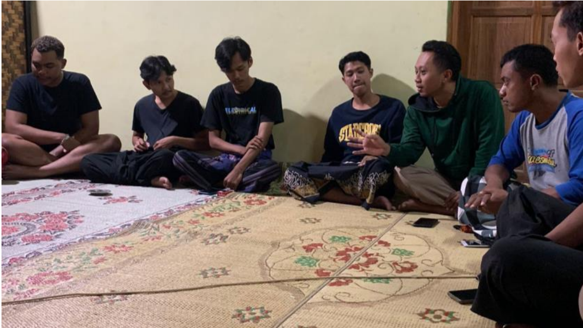
Fig. 2. Meeting with Karang Taruna