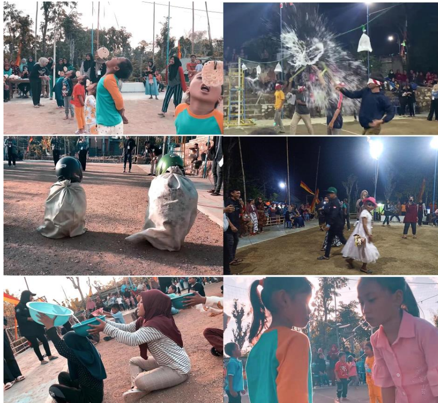
Fig. 4. The 17 August 2022 competition