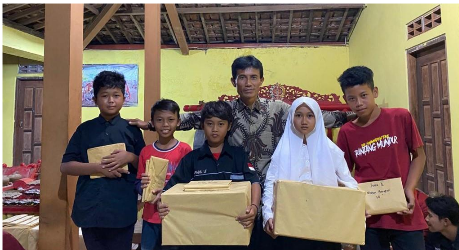
Fig. 5. Presentation of prizes to the winners of the 17 August competition

The announcement of the winners of the competition will be held on August 16 2022 which coincides with the tirakatan night as shown in Figure 5. From the figure it can be seen that the series of tirakatan nights starts with the opening and continues with remarks by the committee and the village head. Then proceed with the main event, namely the distribution of prizes. Prizes given in the form of snacks and groceries. After the distribution of the competition prizes, there was a poetry reading by Karang Taruna members. The next activity is silence and prayer reading. The last activity was closing and watching a national film with the KKN team and the people of Nangsri Kidul.