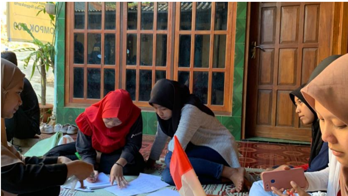
Fig. 3. Preparing for the competition needs