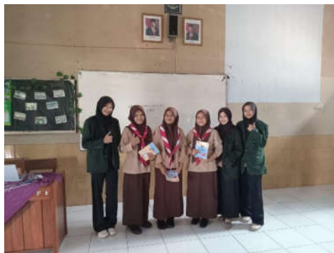
Fig. 6. Prize distribution session

importance of managing their finances. Apart from that, students have a responsibility to pay more attention to spending and using money so that they are not too wasteful.