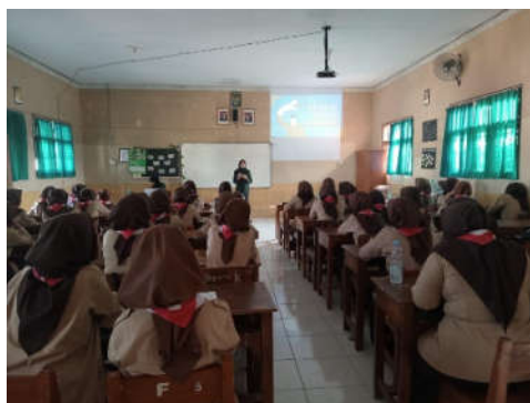
Fig. 4. Material Presentation

In this question and answer session there were three students who asked questions regarding their problems in managing finances, namely how to overcome the financial crisis problem for students, how to earn income for students, and how not to be wasteful in spending as shown in Figure 5. This figure shows that The author provides answers and input according to his personal experience. So that students' mindsets can change in managing their finances, the presenters provide material by thinking positively, critically and realistically about money. Increasing knowledge in the field of financial management can of course be a useful provision for students. By providing real pictures, students must be made aware that students are the young generation who must have a realistic mindset for finances in the long term. Even though they are still teenagers, students need to manage their finances to prepare for the future. By managing finances from adolescence, students can prepare for the future better. Students can save for higher education. This will also increase their independence and learn to be responsible for their own financial decisions. By avoiding unnecessary consumerist behavior, students can prioritize their spending and improve their financial capabilities. Therefore, financial management is very important for teenagers to prepare for a better future.