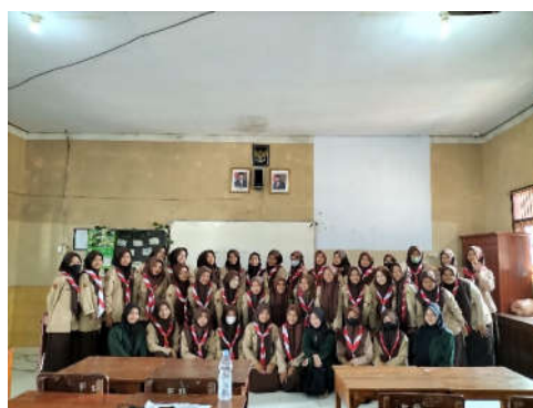
Fig. 7. Group photo