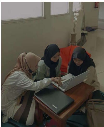
Fig. 2. Planning