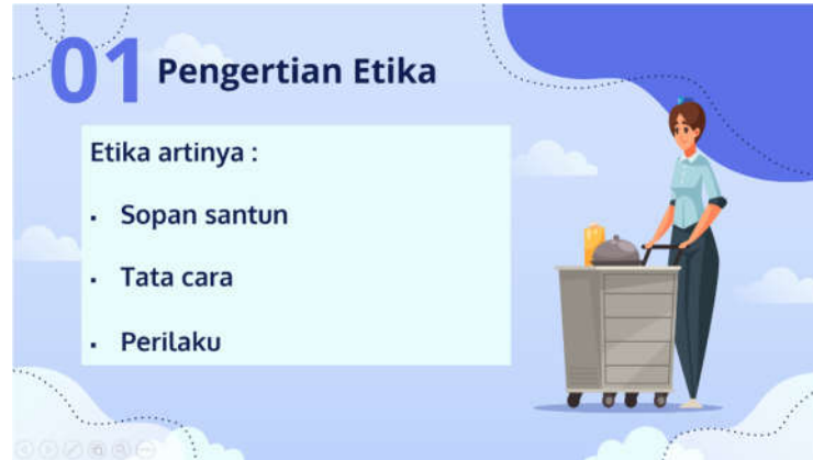
Fig. 4. The Meaning of Ethics

The word "ethics" may sound foreign to female students, so in the first material the author describes using language that is easy to understand, that ethics means the same as behavior, manners or procedures as shown in Figure 3. The figure shows that the term "ethics" comes from ancient Greek. The Greek word ethos in the singular has many meanings: the usual place of residence: meadow, stable; habits, customs, morals, character; feeling, attitude, way of thinking. In the plural form ( ta etha ) it means: custom. And this last meaning is the background for the formation of the term "ethics" which the great Greek philosopher Aristotle (384-322 s.M.) has already used to denote moral philosophy.