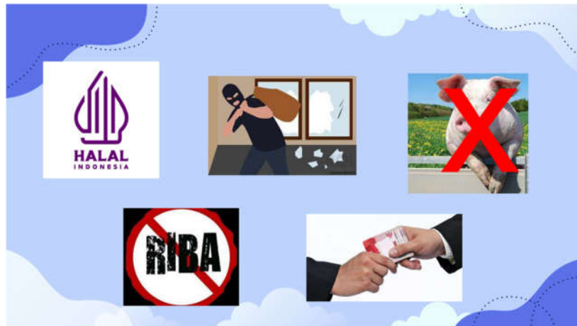
Fig. 6. Things that must be considered in consumption

In Islam, acts of bribery or the like are prohibited, as explained in Surat al-Baqarah verse 188, "And do not be part of you eat the property of the other half of you in a vanity way and (do not) bring (affairs) the property to the judge, so that you can eat part of the property of another person by (doing) sin, even though you know".