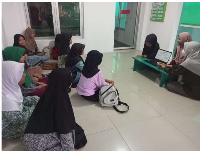
Fig. 7. presentation of the material and questions and answers.

which should the younger siblings come first?". Santriwati unanimously answered "LKS book". From questions like that, it can be said that they can understand the material presented properly. At the end of the socialization event, the presentation of the material was repeated in outline.