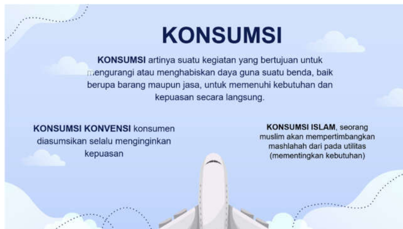
Fig. 5. Definition of Consumption

Meanwhile, the word "consumption" is explained by the sentences "eat" and "use" shown in Figure 5. The figure shows that consumption in relation to Islamic behavior is that a Muslim cannot be free when he wants to eat or consume. Not all food and drinks are free for consumption, and not all goods are free to use. The origin must be clear, goods and food obtained halal. A child prefers a color picture, so the writer includes several pictures and explains how they relate to consumption. In conventional terms, consumption aims to satisfy consumers' self-satisfaction regardless of needs. In Islam satisfaction in consumption is referred to as masalah where in its fulfillment it prioritizes needs.