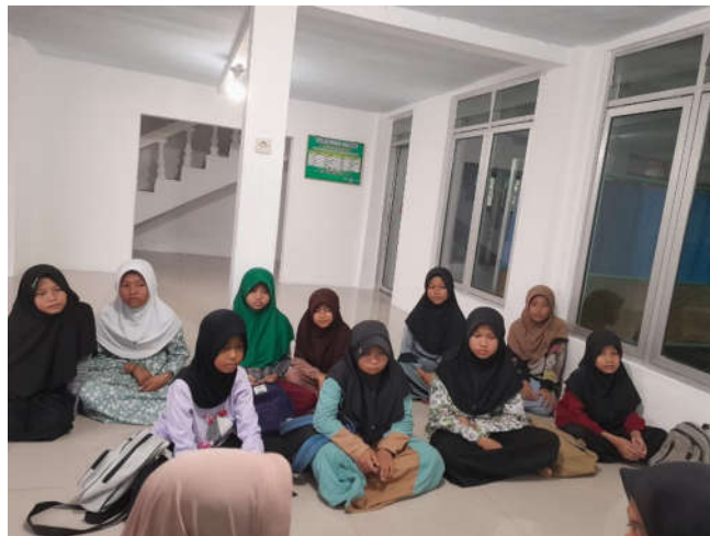
Fig. 3. Submission of Materials

The implementation of socialization activities for the students of madrasah al istiqomah is a form of a series of events carried out in a structured manner as shown in Figure 3. The figure shows that the topic of the material chosen is in accordance with the research subject, namely girls from the alpha generation. At the beginning it was explained that the alpha generation is more literate in technology than the previous generation, so that all forms of information will be more easily accessible, including the world of fashion. As a girl, of course, you are interested in the world of fashion and want to update on every development, especially now that marketplaces or online shops have appeared in many ways. All desires are easy to realize and most are difficult to control. Thus, the seeds of a consumptive spirit arose to fulfill desires without thinking twice and the list of needs was missed. Therefore, through the topic of consumption ethics in Islam, the author wants to provide knowledge to female students so that they will always be self-controlled and careful in consuming.