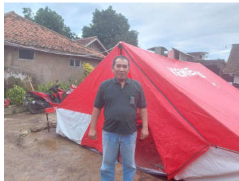
Fig. 6. Tents for earthquake victims

Implementation was a vital stage in community service, especially in disaster mitigation in Cianjur shown in Figure 6. The picture is visible after the natural disaster response team formulated the necessary actions, they began to implement them. At this stage, they acted swiftly to address emerging issues and assist the disaster-affected communities. One of the actions taken was setting up emergency tents. Emergency tents were crucial to provide shelter for disaster-affected communities who lost their homes. Additionally, the natural disaster response team provided clean water and electricity supply since these provisions were usually disrupted during natural disasters. This was essential to ensure that the communities maintained access to clean water and electricity during the recovery period. The team also provided medical equipment and food supplies. Medical equipment was crucial in emergency situations like natural disasters as it could save lives and prevent disease outbreaks. Meanwhile, food provisions were essential to ensure that the communities received sufficient nutritional intake during the recovery period. In this implementation stage, the natural disaster response team is also coordinated with other parties, such as volunteers, aid agencies, and local authorities. This was important to ensure that the assistance provided effectively reached the needy communities.