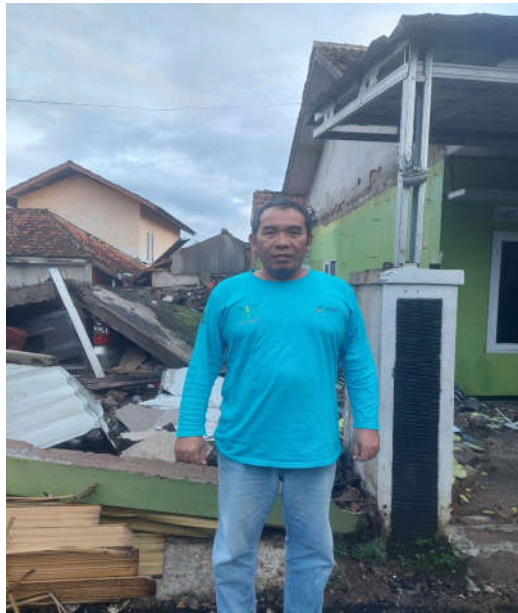
Fig. 4. One of the buildings collapsed

In addition, the natural disaster response team also made plans for logistics management shown in Figure 5. The figure shows that this includes procurement, transportation, and distribution of logistics aid to the needed locations. The goal of logistics planning was to ensure that the logistics assistance could be swiftly and accurately received by the affected communities. Besides action and logistics plans, the natural disaster response team also devised plans for team management. This planning encompasses assigning tasks and responsibilities to each team member, as well as determining task schedules. The objective was to ensure that each team member had a clear and effective role in assisting with disaster mitigation in Cianjur.