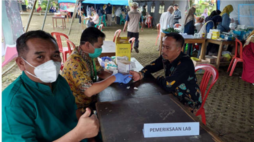
Fig. 2. Lab examination of earthquake victims

response team identified and took measures to repair or address the infrastructure damage in the affected areas.