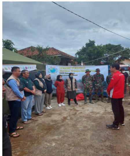
Fig. 5. Briefing with the team before natural disaster management

In addition, the natural disaster response team also made plans for logistics management shown in Figure 5. The figure shows that this includes procurement, transportation, and distribution of logistics aid to the needed locations. The goal of logistics planning was to ensure that the logistics assistance could be swiftly and accurately received by the affected communities. Besides action and logistics plans, the natural disaster response team also devised plans for team management. This planning encompasses assigning tasks and responsibilities to each team member, as well as determining task schedules. The objective was to ensure that each team member had a clear and effective role in assisting with disaster mitigation in Cianjur.