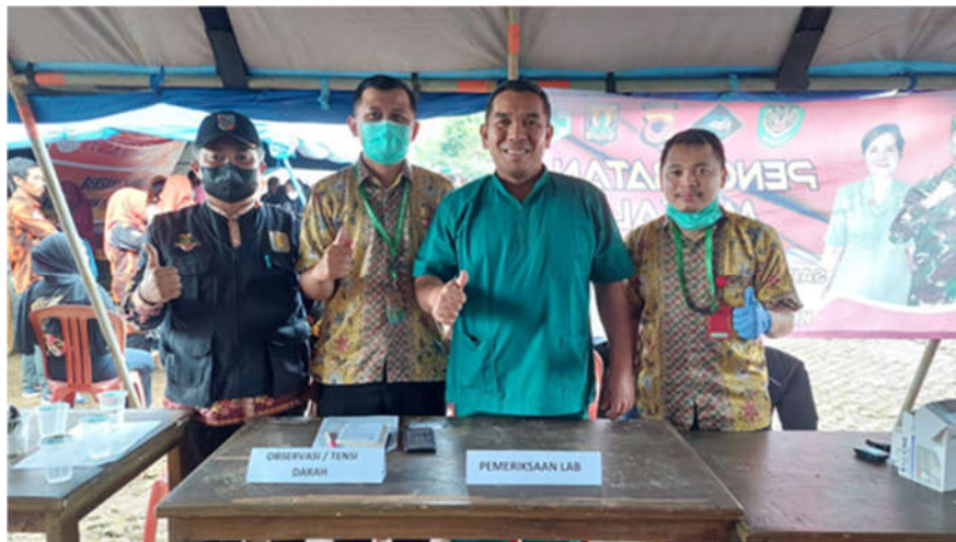
Fig. 3. Blood test team

Furthermore, the shortage of clean water and electricity supply was also a frequent problem during natural disasters. Figure 3 shows that the natural disaster response team identified areas experiencing these shortages and took efforts to rectify or resolve the issues. Their efforts included installing generators and delivering clean water to areas in need. Health issues were also a concern for the natural disaster response team. Many community members suffer injuries or health disorders such as diarrhea, fever, and respiratory infections during disasters. As a result, the team identified areas requiring medical assistance and provided the necessary medical equipment. By conducting problem identification, the natural disaster response team can map out areas in need of assistance and prioritize actions to be taken. Additionally, problem identification helped them prepare the required resources and equipment for disaster mitigation in Cianjur.