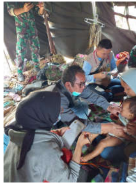
Fig. 7. Examination of one of the victims and recording of medical records

Documentation is done by capturing the activities carried out by the natural disaster response team through photographs. These photos serve as evidence that the team has taken actions in accordance with the planning. Additionally, these photos can be used for promotion and publicity purposes for the activities carried out by the natural disaster response team. Apart from photographs, the team also records data of patients treated during the disaster management process. This data is crucial for medical purposes, enabling medical personnel to easily access and monitor patient health. Furthermore, this data can be used for evaluation and improvement of future disaster management. In addition to documentation, the natural disaster response team also creates daily reports that detail the activities undertaken each day. These daily reports serve as a form of accountability and transparency regarding the activities conducted. With the presence of daily reports, authorities and the public can have a detailed understanding of what the natural disaster response team has accomplished.