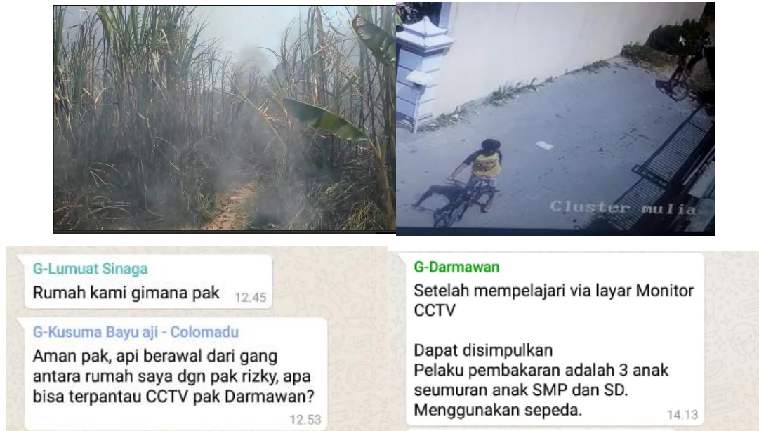
Fig. 5. Documentation of the Sugarcane Plantation Fire Case