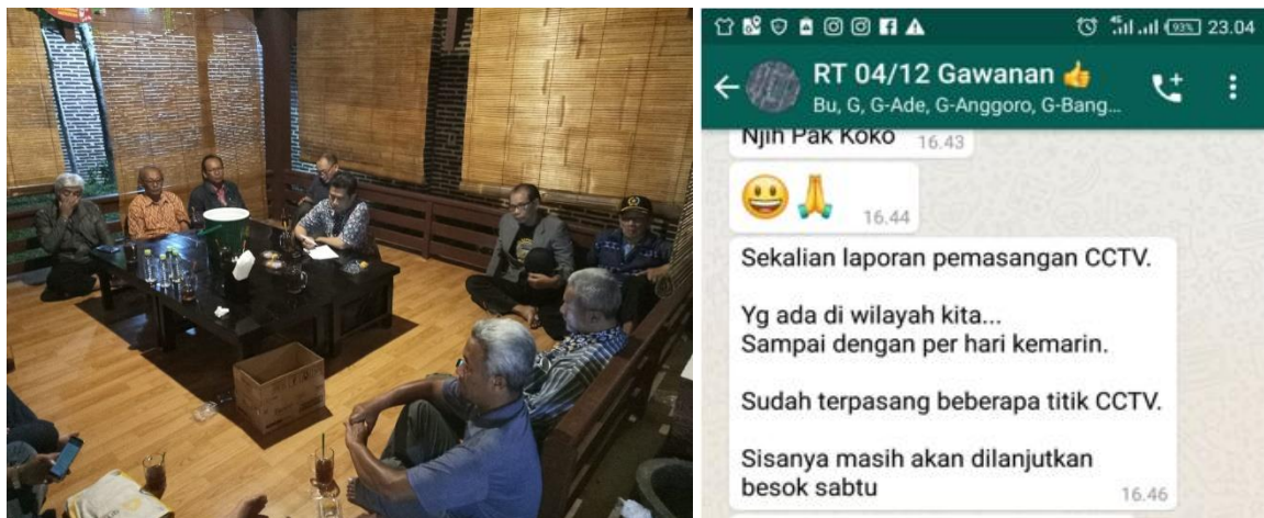
Fig. 4. i-Siskamling Socialization to Residents

Matters relating to the use and benefits of i-Siskamling and also the location where the tools will be placed are socialized with the residents of the two partners. Socialization is carried out using the village WA group or through RT meetings. The following is documentation of socialization regarding matters related to i-Siskamling, both the equipment and the location where the i-Siskamling equipment is installed, shown in Fig. 4.