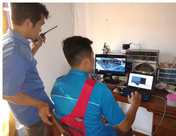
Fig. 3. Monitor Settings for Image and Time Visualization

After the installation of all CCTV cameras has been completed, and has been connected to each component, then the visual adjustment of the image on the CCTV monitor is carried out, as shown in Fig. 3.