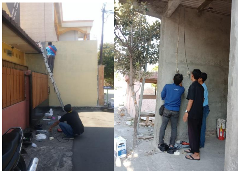
Fig. 2. The CCTV Installation Stage

The installation of the i-Siskamling equipment is carried out with the help of four workers who help install the equipment, in the form of cameras, access points, and wiring. The following Fig. 2 is documentation of the installation of i-Siskamling equipment at Partner locations.