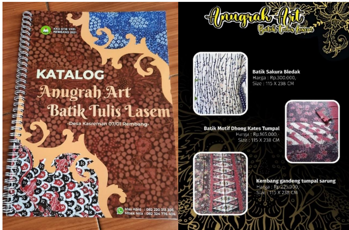
Fig. 2. Anugrah Art Batik Patterns Catalog