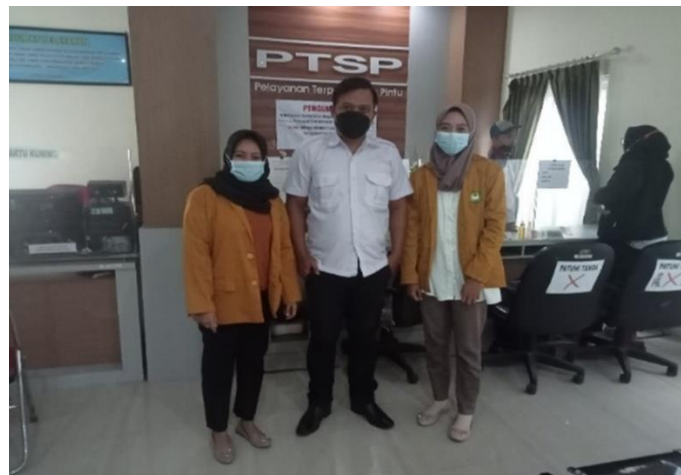
Fig. 4. Business Legality Licensing Assistance.