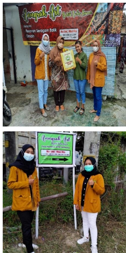
Fig. 1. Banner and Sign

The cataloging was intended to provide consumers with multiple examples of image patterns from Anugrah Art Batik. Customers can order the batik based on their preferences and budget. Figure 2 displays the Batik catalog.