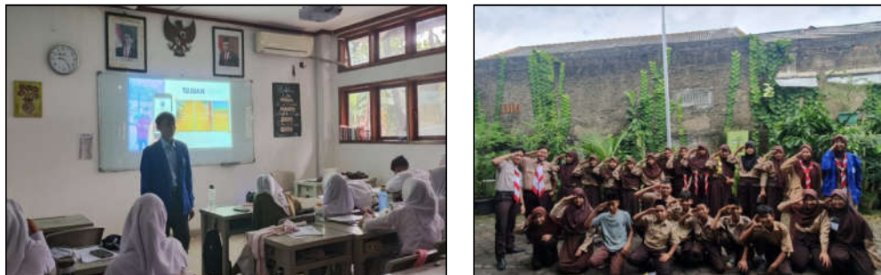
(a) (b) Figure 2. Training Activities (a) Triguna Vocational School (b) MI Nurul Muta'alimin 2

The activities carried out at MI Nurul Muta'alimin include increasing scout extracurricular activities which were previously stopped due to the transfer of teachers. Empowerment in this area has received a very good response because if extracurricular activities stop, students will easily feel bored with learning activities in class alone. Improving students' intellectuality in the extracurricular area is learning that is very necessary, especially for elementary school students who tend to be active.