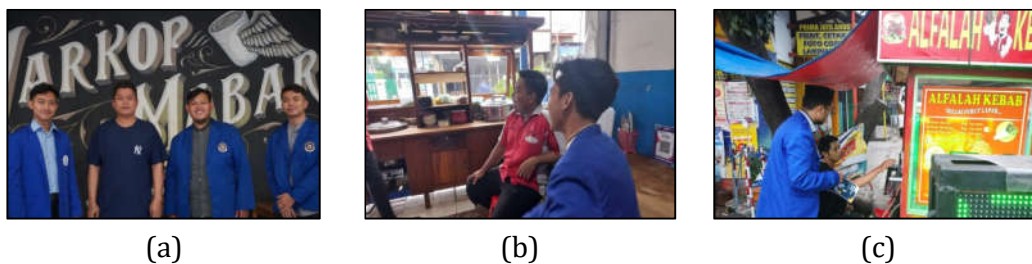
Figure 2. Digital Business Socialization (a) Warkop Mabar (b) Bakso Pak Kempis (c) MSMEs around

With this problem, Darunnajah University students carried out outreach activities to MSME owners so they could market products through social media and online platforms shopeefood, gofood and grabfood as well as cashless payments using Q-Ris.