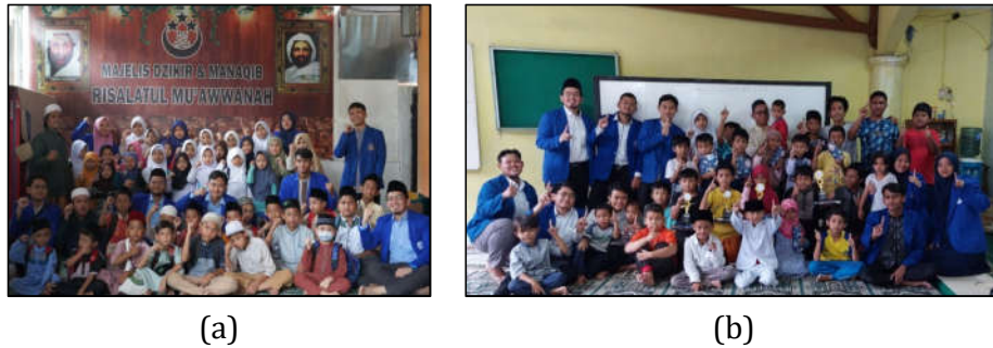
Figure 1. TPA activities (a) Majelis Ta'lim Risalatul Mu'awwanah (b) Al-Hidayah Mosque

40 people. Meanwhile, at the Al-Hidayah Mosque, initially only around 5 to 6 children were interested in attending TPA, which increased to 30 children per day.