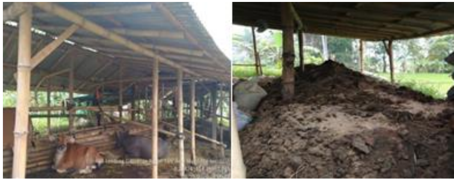
Fig. 2. The location of the cage and the manufacture of solid organic fertilizer

Utilizing livestock manure as organic fertilizer can reduce the negative environmental impacts in Segobang village and increase the income of Gapoktan and existing farmer groups. As subsidized chemical fertilizers from the government decrease, Gapoktan can use organic fertilizers that have been made. So that it can cut costs incurred by farmers for their crops. The farmer group has learned a lot and tried to make organic fertilizer from animal husbandry products so that it can be practiced by group members.